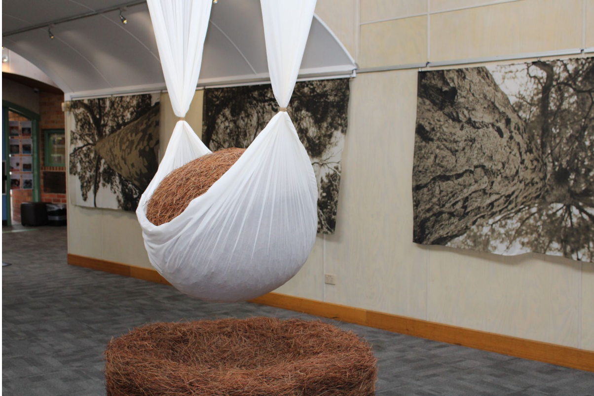
Artist in Residence Program - Marynes Avila - Oasis - April 2022